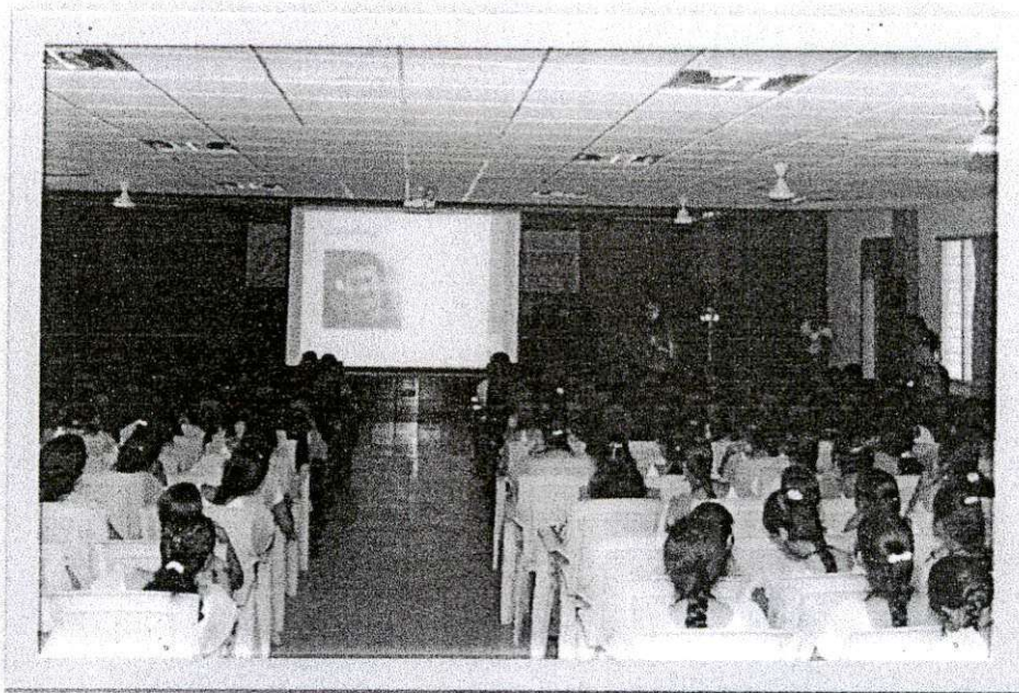
Photography contest on International photography day